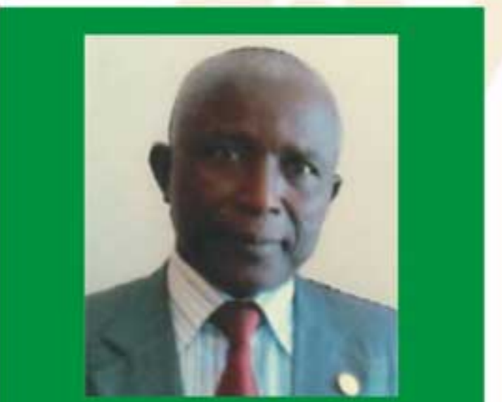
THE AFRICAN UNION: A VERITABLE PROGENY OF PAN-AFRICANISM By MIS Gassama Directorate of Conference Management and Publications (DCMP)

There can be no gainsaying that the launch of the African Union in the