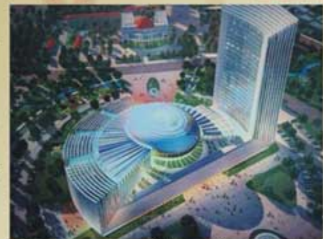
Artist impression of the new African Union headquarters in Addis Ababa.

All of this, diplomats agreed with Zuma, was achieved starting from a reality of fragmentation and destruction caused by centuries of colonization, whose consequences are still visible in most African nations, despite the aforementioned prosperity.