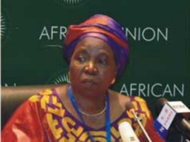
NKOSAZANA DLAMINI ZUMA President of the African Union Commission

Africa is facing a variety of problems, but over the last 50 years has witnessed substantial progress in economic growth, a consolidation of peace and improved democracy, stressed African Union authorities in Addis Ababa today.