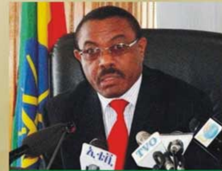
H.E. HAILE MARIAM DESSALEGN Prime Minister of the Federal Democratic Republic of Ethiopia and Chairperson of the African Union on the Occasion of the Golden Jubilee Celebrations of the OAU/AU

There is no doubt that the OAU played an invaluable role in the liberation of our continent and, for this, we have to pay tribute to successive generations of African leaders who have bequeathed to us a continent free from the shackles of colonialism and Apartheid. The OAU has also contributed to the